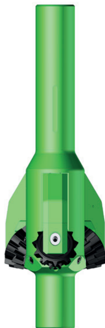
26" hole opener

TYPE SH for very hard formations: tungsten carbide inserts. Inserts shape can be customized as per the customer need: chisel, ballistic, round top, etc